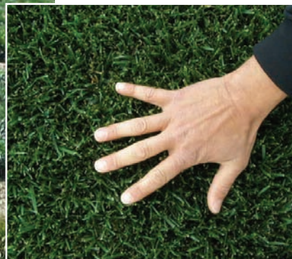
Pershing Perennial Ryegrass is very plush, dark-green in color and very uniform in leaf size.